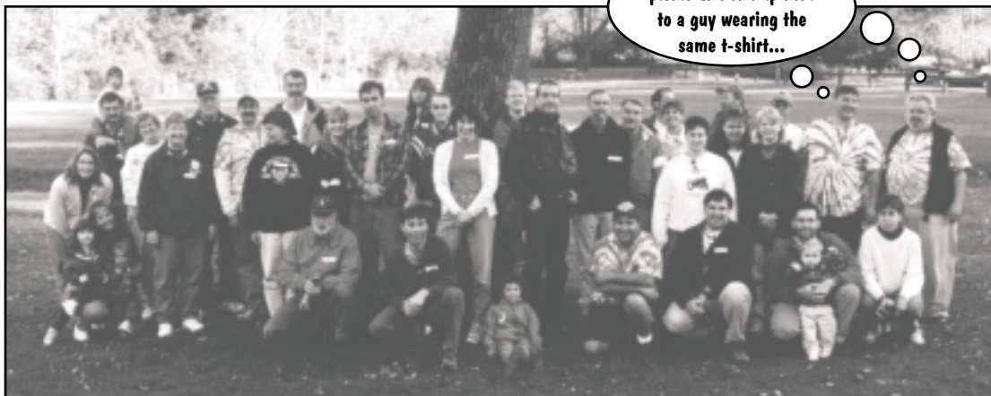
Thanks to all who made the 2nd Annual Picnic a big success!

Important: The Massawepie Staff Alumni Association also holds its Annual Members meeting after dinner on Saturday; all members are encouraged to attend!