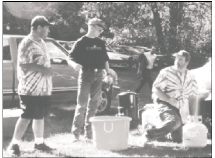
Clams?!? I thought YOU brought the clams!

Please note that if you make a contribution of $50 or more to the Alumni Association Massawepie Fund (which supports the 50th Anniversary Celebration and the Alumni Association's camp projects) with your renewal the $10 membership fee for 2002-2003 will be waived.